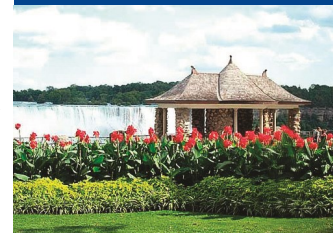
Visit beautiful Queen Victoria Park

Departure: Dorcas Thrift Shop, 187 High House Rd, Cary, NC @ 8 am