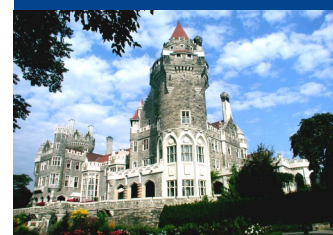
Magnificent Casa Loma Castle in Toronto