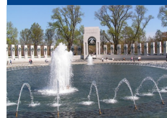
World War II Memorial